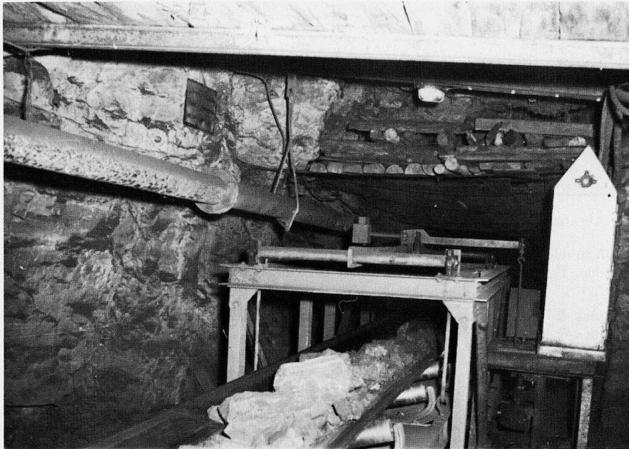
Stollen I: Bandwaage (1956)